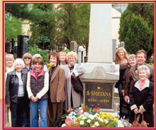
Visiting Smetana's grave in the Vysehrad national cemetery